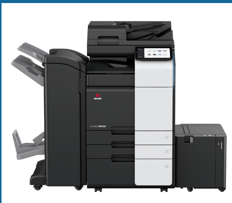
d-Color MF309 with DF-714+PC-416+LU-302+RU-513+FS-536SD

New 10.1" multi-touch operator panel, which can vibrate to provide greater touch sensitivity